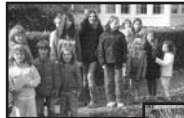
Photos from Childcare Days with Girl Scout Troup 623